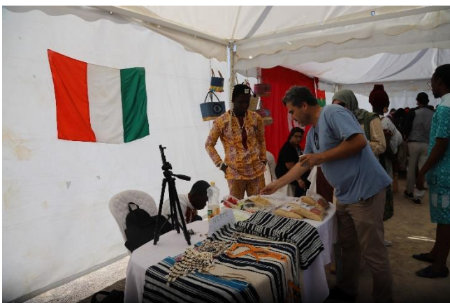
Burkina Faso stand