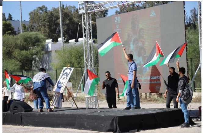
The Dabka dance