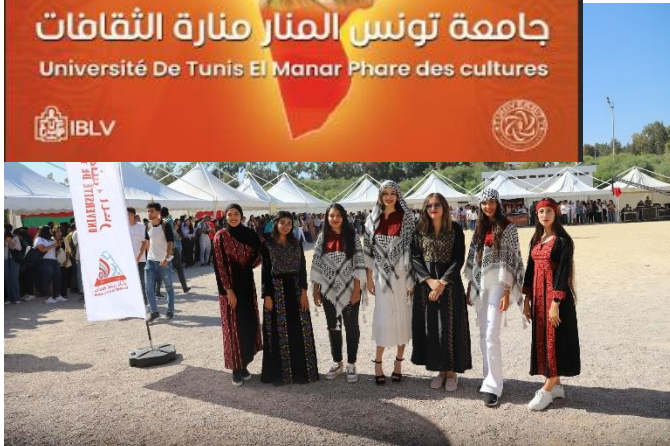
Parade of traditional costumes

"L'Université de Tunis El Manar Phare des Cultures" is a cultural event organised by the University of Tunis El Manar in its first edition on 26 October 2022 to present the cultural heritage of the participating countries through exhibitions and artistic performances presented by students who reflect their vision of their different cultural traditions and values.