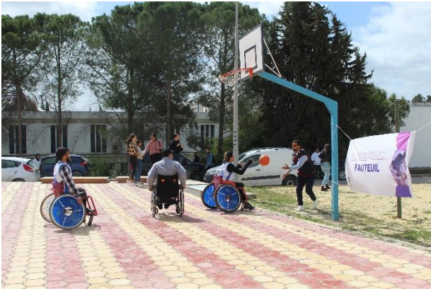
Able-bodied students took part in the wheelchair match