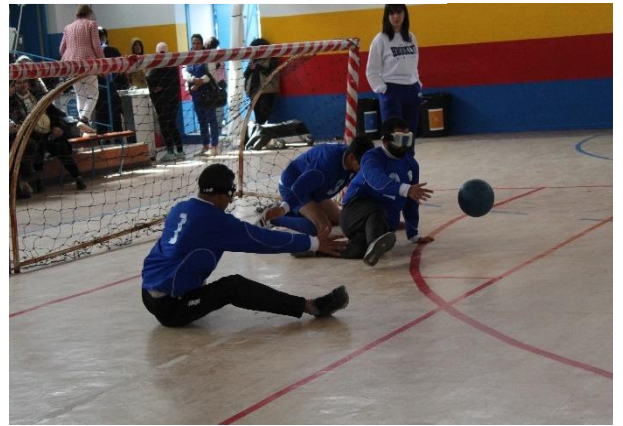
Able-bodies students were blindfolded