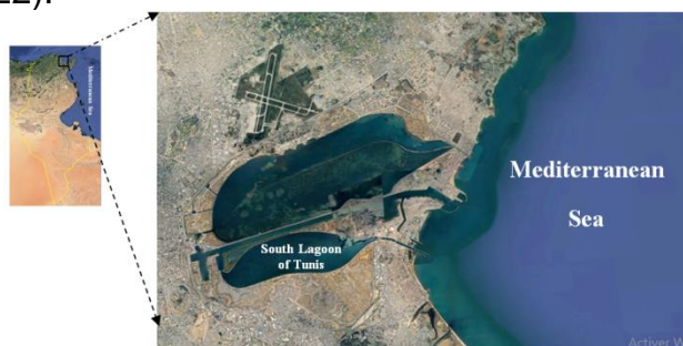
Location map of Tunis Lagoon

A study titled “Bioaccumulation of polycyclic aromatic hydrocarbons (PAH) in Polychaeta Marphysa sanguinea in the anthropogenically impacted Tunis Lagoon: DNA damage and immune biomarkers” was carried out by Mdaïni et al. (2022).