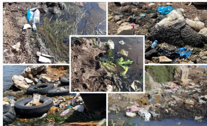
Photos showing some of the unmanaged/uncontrolled plastic waste observed along the coast of the Bizerte lagoon

Wakkaf et al. (2022) conducted a research study focusing on the seasonal patterns of microplastics in surface sediments of the heavily impacted mediterranean Bizerte lagoon, in Northern Tunisia.