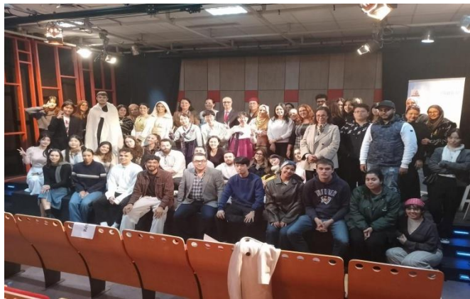
The celebration of world Arabic language day on November 30, 2023.

The Institute welcomes students from diverse backgrounds. This multicultural environment creates an inclusive and harmonious space for exchange, essential for reducing prejudices.