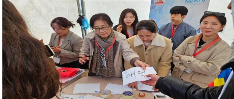
Participation of Korean language teachers in the event 'UTM: Beacon of Cultures.