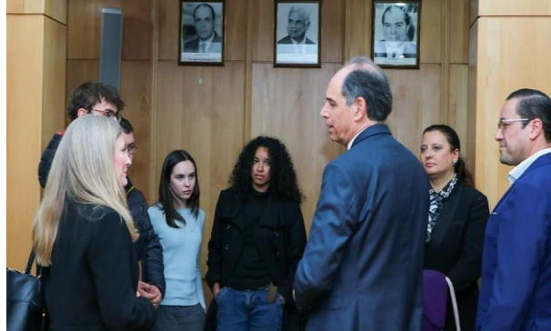
Promotion of partnership with the University of Oxford

Transforming our relationship with nature is key to a sustainable future