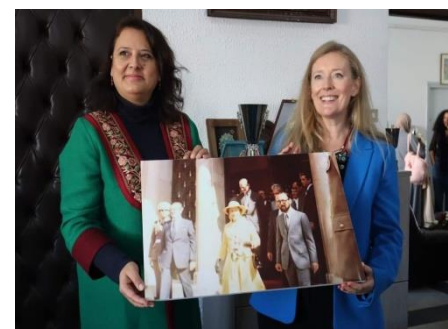
Photo of Queen Elizabeth II's visit to the Bourguiba Institute in 1980.