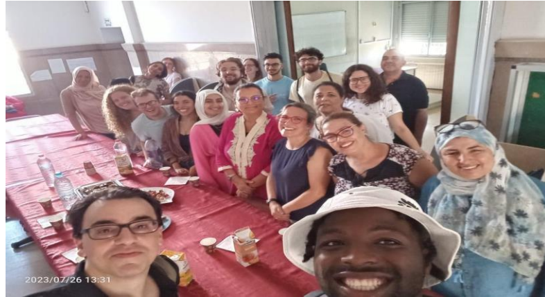
Participation of students from Le Moyne College (USA)

Transforming our relationship with nature is key to a sustainable future