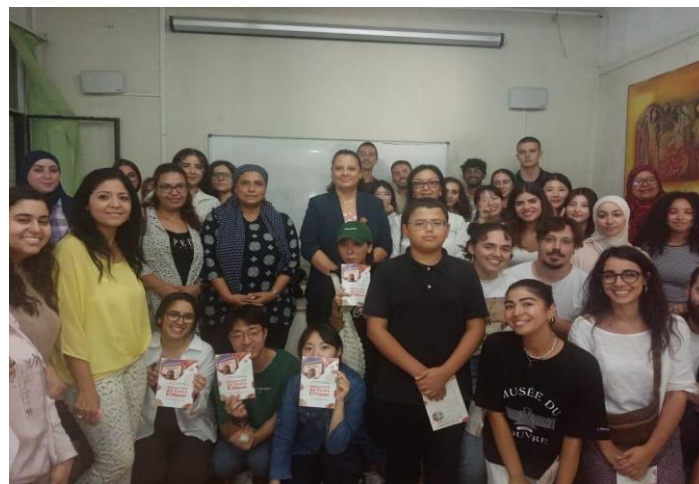
Participation of students from the Bourguiba Institute for Modern Languages in Tunis in the cultural event 'UTM: Beacon of Cultures.'