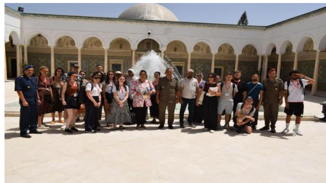
Visit of IBLV students to the National Military Museum

This museum showcases the military history of Tunisia, from the Carthaginian era to the present day. It is located in the city of Manouba, specifically within the Palace of the Rose.